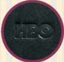
(VL) Venetian Leather