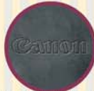
(PV) Synthetic Leather